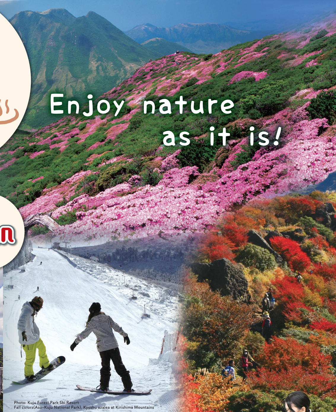
Photo: Kuju Forest Park Ski Resort Fall colors(Aso-Kuju National Park), Kyushu azalea at Kirishima Mountains